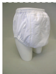
Pull-On Terry Diaper in White Flannel.

Insert Pads are constructed of 8 layers of 100% cotton flannel. These provide extra absorption when used in conjunction with pull-on or flat diapers, and are particularly good for nighttime use. White only.