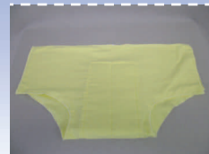
Contour in Yellow Flannel