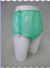
Gary Original Snap-On in Green Apple.