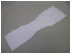
Flat Diapers shown in Contour Yellow flannel