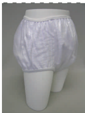
Pull-On in Softwear lined with White Terry.