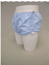
Snap-On with Blue Flannel Outer

Our Original Snap-On pant with fabric outer is a generous cut, whether ordered in Regular, Bikini or Long Waist style. Nickel-plated brass snaps on the sides allow for easy changing. It is designed to be worn with a diaper. It has an extra wide crotch for maximum room.