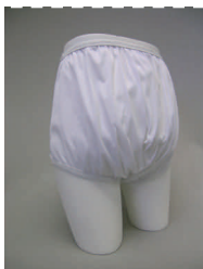
Pull-On with Nylon Tricot Outer