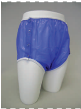
Snap-On Softwear lined with Bedtime Bears, shown window style.

Our Original Snap-On pant is a generous cut, whether ordered in Regular, Bikini or Long Waist style. Nickel-plated brass snaps on the sides allow for easy changing. It is designed to be worn with a diaper. It has an extra wide crotch for maximum room. A flannel or terry lining adds softness and absorbency for added protection. Terry-lined pants are commonly used as training pants.