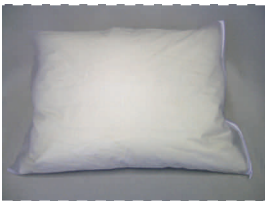
Pillow Cover – Zippered Top in Softwear.