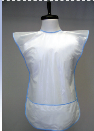
Smock with Tray in Milky White with Pastel Blue Poly Binding.