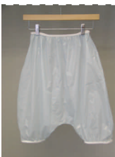
Gary Bloomer in Blue Star.

This pull-on pant has knee-length legs to provide more coverage, and is designed to be worn over a diaper. The extra-wide crotch and seams of legs are heat-sealed (not stitched,) to make it leak-proof. This pant provides maximum moisture containment and is particularly good for night wear.