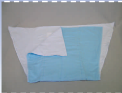
Butterfly in Blue Flannel

Gary flat diapers are designed to be worn under Gary pants. They are secured using pins, the old-fashioned way. We use 6 layers of 100% cotton flannel in the center panel. Flat Diapers are available in three shapes: Prefold, Contour or Butterfly. Select outer flannel; inner is usually white.