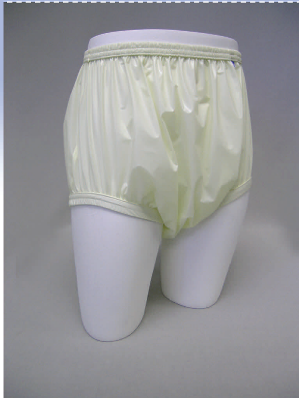
Comfort Pant in Lemon Pastel Pull-On