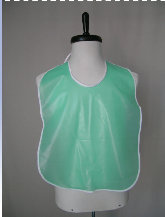
Bib in Green Apple with White Poly Binding.