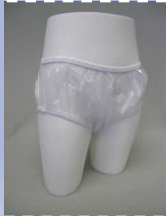
Gary Original Pull-On in Softwear, bikini cut.