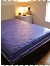
Mattress Cover – Zippered Top in Sapphire.

If ordering Frosty Clear, all covers for mattresses, flat sheets and duvet covers will be seamed over 54" wide; Euroflex will be seamed over 60" wide.